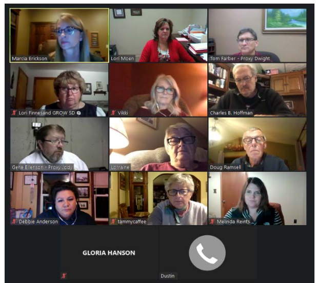
NESDCAP Board of Directors Conducting November’s Board Meeting